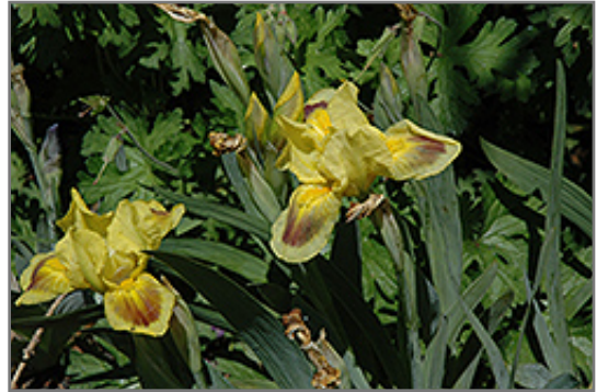
Curio Iris flowers

Group/Class: Miniature Dwarf Bearded Iris