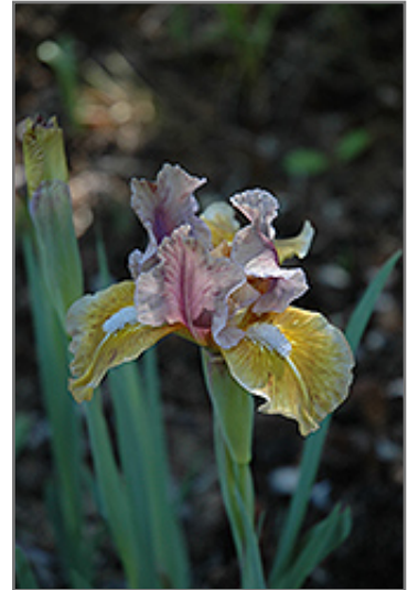
Jungle Warrior Iris flowers