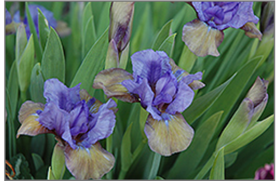
Wizard of Hope Iris flowers

Group/Class: Standard Dwarf Bearded Iris