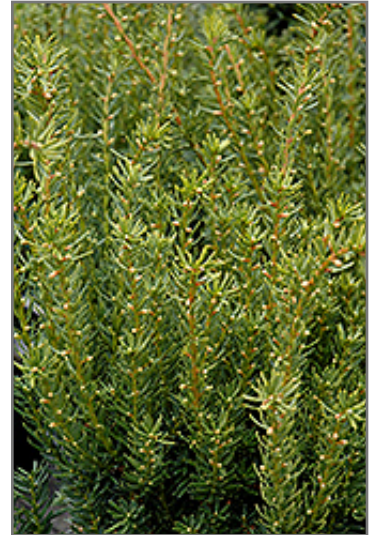
Fairview Yew foliage

Fairview Yew will grow to be about 5 feet tall at maturity, with a spread of 10 feet. It tends to fill out right to the ground and therefore doesn't necessarily require facer plants in front, and is suitable for planting under power lines. It grows at a slow rate, and under ideal conditions can be expected to live for 50 years or more.