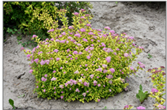
Sundrop Spirea in bloom