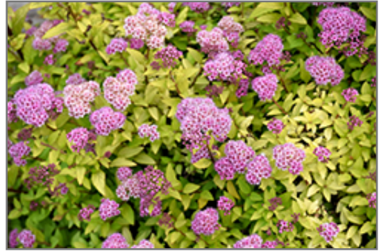
Sundrop Spirea flowers

Sundrop Spirea is recommended for the following landscape applications;