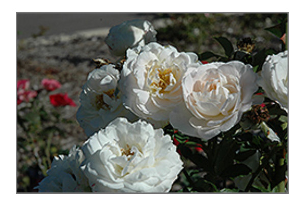
Snowdrift Rose flowers