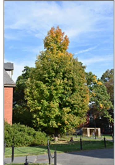
Green Column Sugar Maple