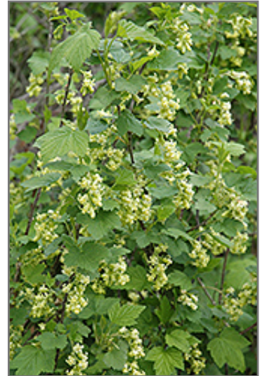
Wild Black Currant flowers

Wild Black Currant is recommended for the following landscape applications;