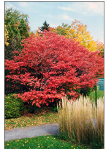
Shadblow Serviceberry in fall