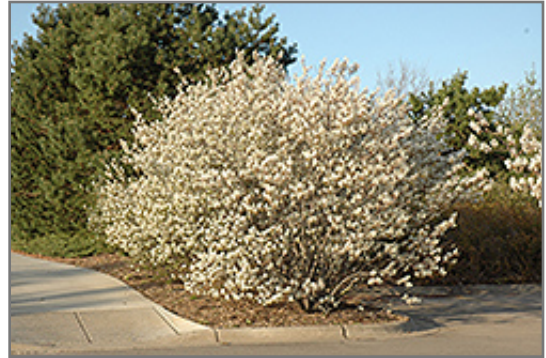
Shadblow Serviceberry in bloom

Shadblow Serviceberry is a multi-stemmed deciduous shrub with an upright spreading habit of growth. Its average texture blends into the landscape, but can be balanced by one or two finer or coarser trees or shrubs for an effective composition.