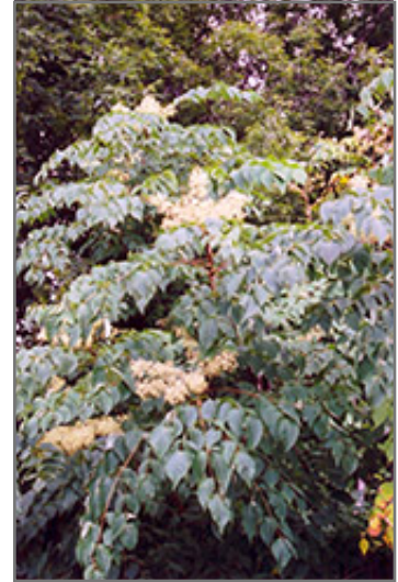
Hercules Club flowers

* This is a 'special order' plant - contact store for details