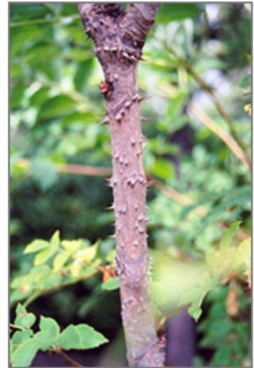
Hercules Club bark