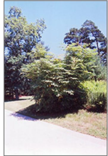
Hercules Club

Hercules Club is recommended for the following landscape applications;