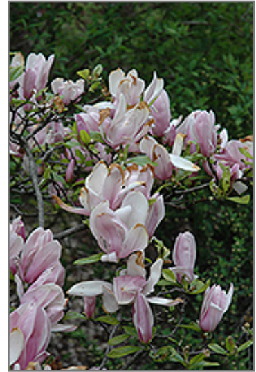
George Henry Kern Magnolia flowers