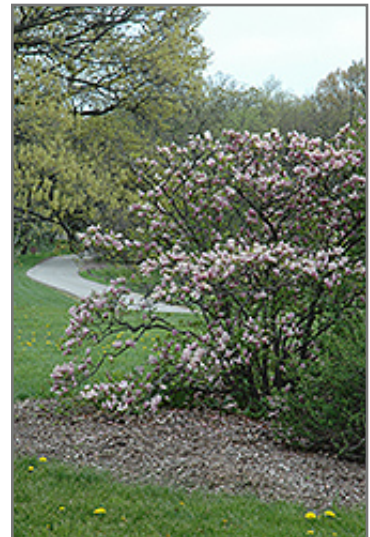
George Henry Kern Magnolia in bloom