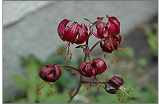
Sarcee Martagon Lily flowers