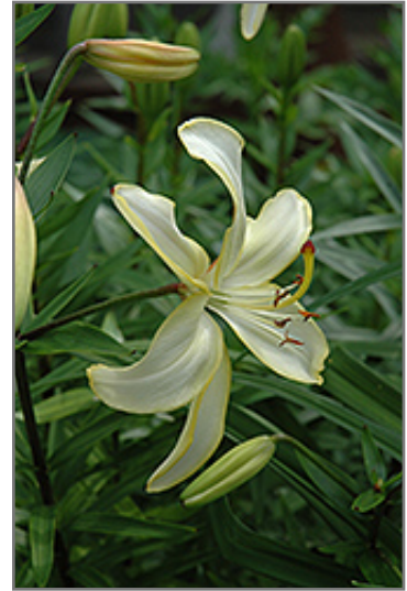
Monique Lily flowers

Monique Lily will grow to be about 24 inches tall at maturity, with a spread of 12 inches. When grown in masses or used as a bedding plant, individual plants should be spaced approximately 10 inches apart. It grows at a fast rate, and under ideal conditions can be expected to live for approximately 10 years. As an herbaceous perennial, this plant will usually die back to the crown each winter, and will regrow from the base each spring. Be careful not to disturb the crown in late winter when it may not be readily seen!