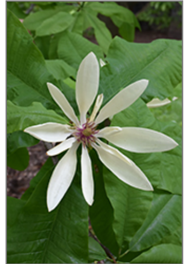
Umbrella Magnolia flowers