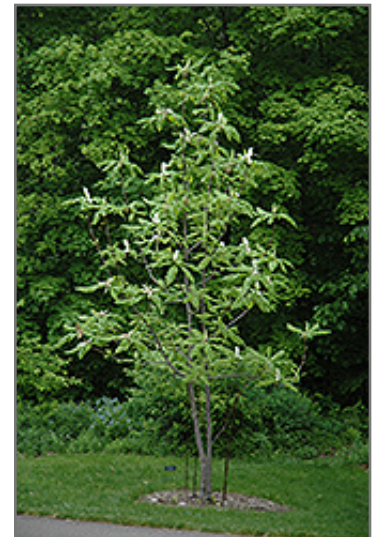
Umbrella Magnolia in bloom