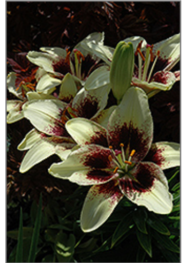
Black Spider Lily flowers