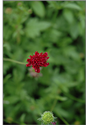
Mars Midget Scabious flowers