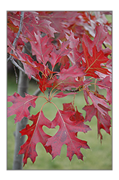
Northern Pin Oak in fall