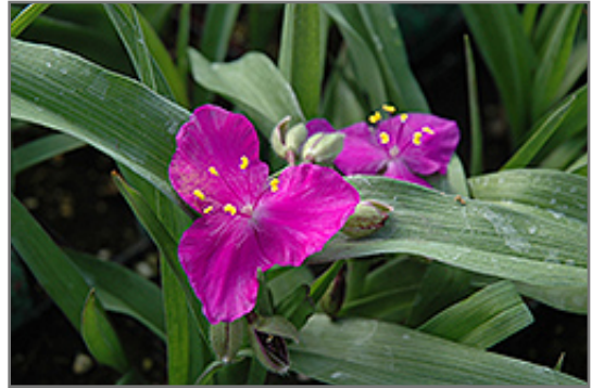
Carmine Glow Spiderwort flowers