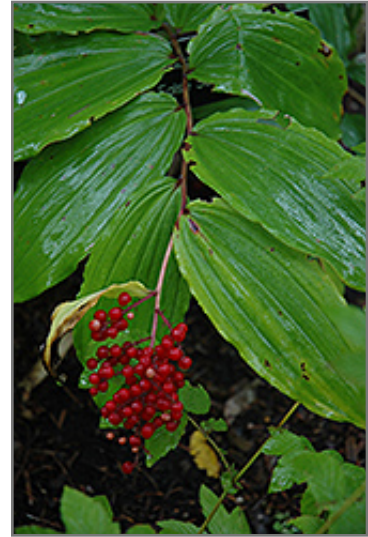
False Solomon's Seal fruit

False Solomon's Seal is primarily grown for its highly ornamental fruit. It features an abundance of magnificent red berries from late summer to early fall. It has masses of beautiful panicles of creamy white flowers at the ends of the stems from mid to late summer, which are most effective when planted in groupings. Its oval leaves remain forest green in color throughout the season.