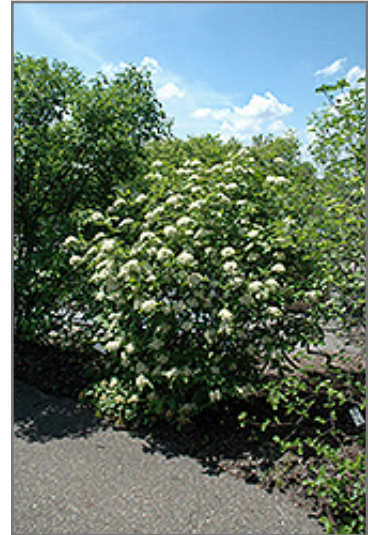
Witherod Viburnum in bloom