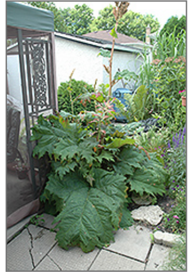
Red Selection Ornamental Rhubarb