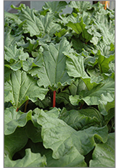
Canada Red Rhubarb

This is an herbaceous perennial with a rigidly upright and towering form. Its wonderfully bold, coarse texture can be very effective in a balanced garden composition. This plant will require occasional maintenance and upkeep, and can be pruned at anytime. Deer don't particularly care for this plant and will usually leave it alone in favor of tastier treats. It has no significant negative characteristics.