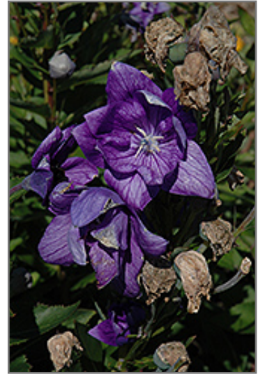
Hakone Double Blue Balloon Flower flowers

Hakone Double Blue Balloon Flower will grow to be about 18 inches tall at maturity extending to 24 inches tall with the flowers, with a spread of 18 inches. When grown in masses or used as a bedding plant, individual plants should be spaced approximately 15 inches apart. It grows at a medium rate, and under ideal conditions can be expected to live for approximately 10 years. As an herbaceous perennial, this plant will usually die back to the crown each winter, and will regrow from the base each spring. Be careful not to disturb the crown in late winter when it may not be readily seen!