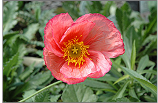
Champagne Bubbles Poppy flowers

Champagne Bubbles Poppy will grow to be only 6 inches tall at maturity extending to 18 inches tall with the flowers, with a spread of 18 inches. When grown in masses or used as a bedding plant, individual plants should be spaced approximately 14 inches apart. It grows at a fast rate, and under ideal conditions can be expected to live for approximately 3 years. As an herbaceous perennial, this plant will usually die back to the crown each winter, and will regrow from the base each spring. Be careful not to disturb the crown in late winter when it may not be readily seen! As this plant tends to go dormant in summer, it is best interplanted with late-season bloomers to hide the dying foliage.