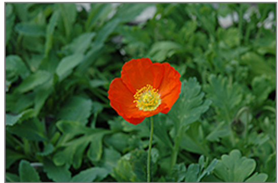
Champagne Bubbles Poppy flowers