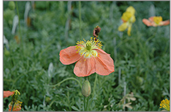
Alpine Poppy flowers