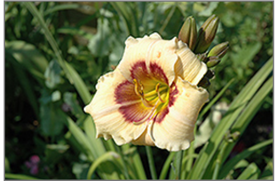
Jason Mark Daylily flowers

Beautiful creamy white flowers with lemon yellow throats and crimson red center rings stand out against strappy green foliage; a striking addition to patio container or perennial beds and borders; blooms early summer with good reblooming qualities