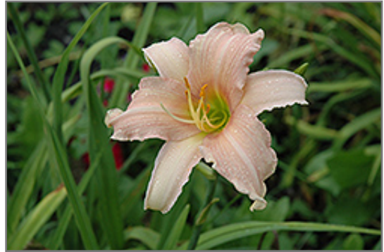
Orphan Daylily flowers

Lightly ruffled shell pink flowers with lemon yellow throats stand tall above low growing mounds of arching green foliage; excellent addition to borders, beds and containers; early-midseason blooms add a touch of softness; low maintenance and easy to grow