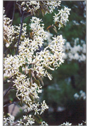
Prince William Serviceberry flowers

Prince William Serviceberry is recommended for the following landscape applications;