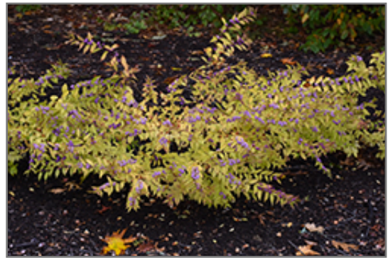
Early Amethyst Beautyberry fruit