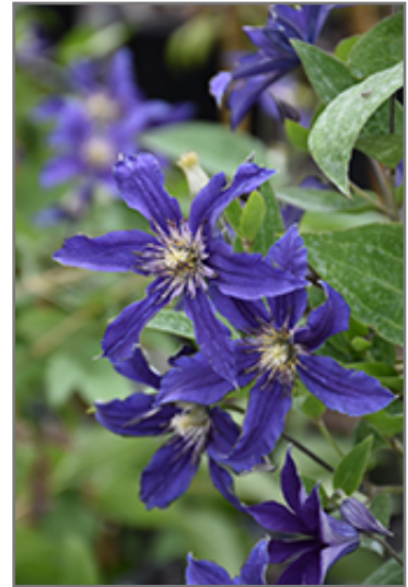
Sapphire Indigo Clematis flowers