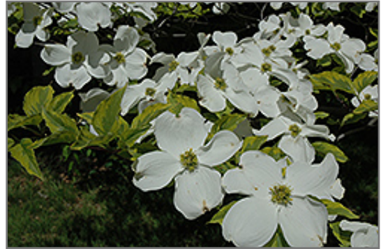
Rainbow Flowering Dogwood flowers

This is a relatively low maintenance tree, and should only be pruned after flowering to avoid removing any of the current season's flowers. It is a good choice for attracting birds to your yard. Gardeners should be aware of the following characteristic(s) that may warrant special consideration;