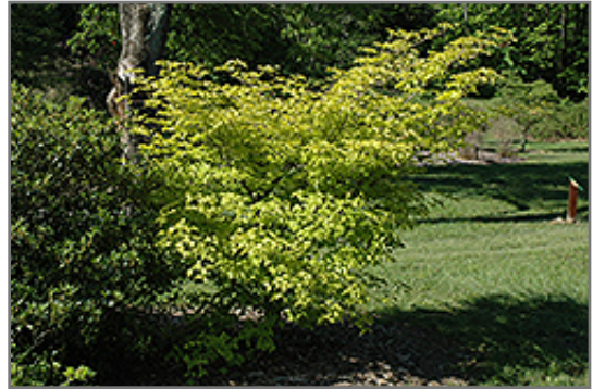
Limon Ripple Chinese Dogwood

Limon Ripple Chinese Dogwood is recommended for the following landscape applications;