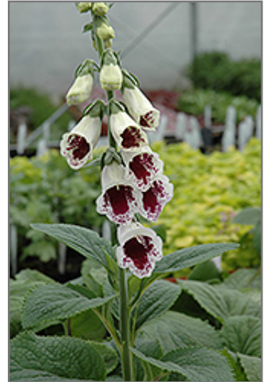
Pam's Choice Foxglove flowers