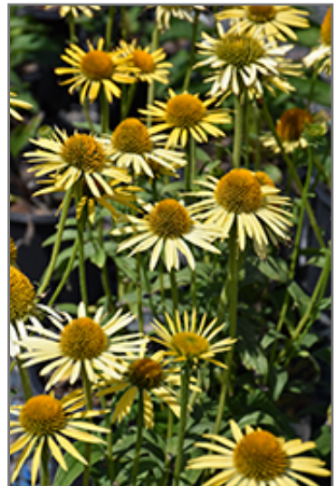
Maui Sunshine Coneflower flowers