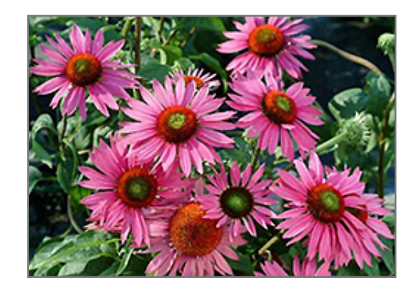
Green Eyes Coneflower flowers