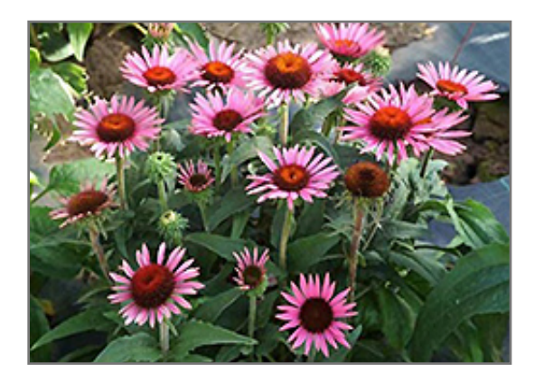
Lilliput Dwarf Coneflower flowers