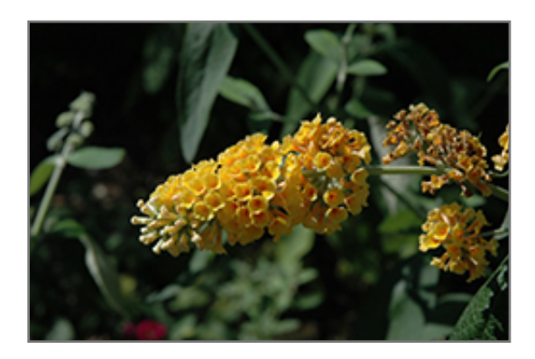
Honeycomb Butterfly Bush flowers

Honeycomb Butterfly Bush is recommended for the following landscape applications;