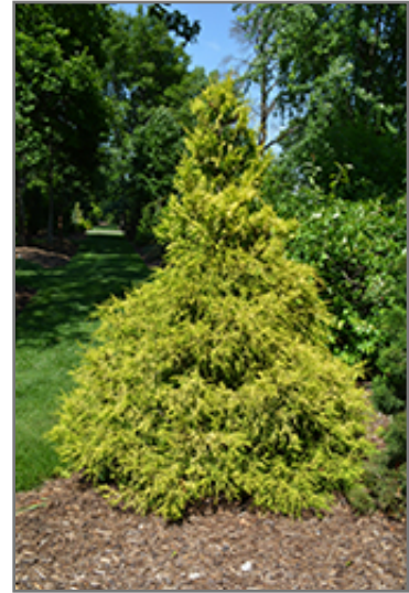
Golden Mop Falsecypress

Golden Mop Falsecypress is recommended for the following landscape applications;