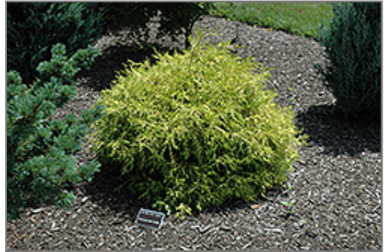
Golden Mop Falsecypress

This shrub does best in full sun to partial shade. It prefers to grow in average to moist conditions, and shouldn't be allowed to dry out. It is not particular as to soil type, but has a definite preference for acidic soils. It is highly tolerant of urban pollution and will even thrive in inner city environments. Consider applying a thick mulch around the root zone in winter to protect it in exposed locations or colder microclimates. This is a selected variety of a species not originally from North America.