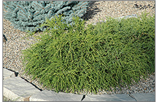
Mops Falsecypress