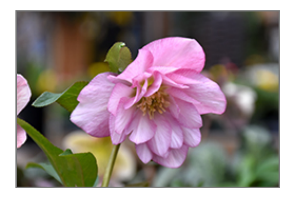
Cotton Candy Hellebore flowers