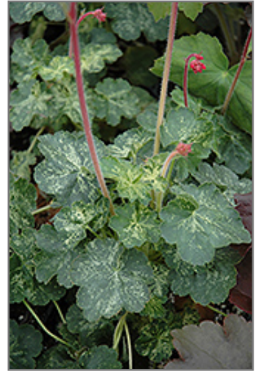
Hercules Coral Bells foliage