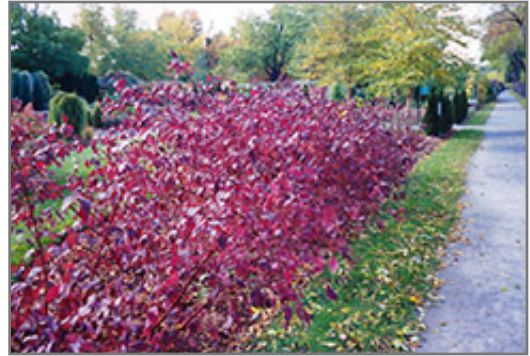
Siberian Pearls Dogwood in fall

Siberian Pearls Dogwood will grow to be about 8 feet tall at maturity, with a spread of 7 feet. It tends to fill out right to the ground and therefore doesn't necessarily require facer plants in front, and is suitable for planting under power lines. It grows at a fast rate, and under ideal conditions can be expected to live for approximately 20 years.