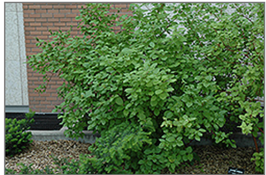
Siberian Dogwood