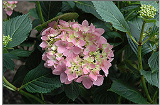
Shamrock Hydrangea flowers