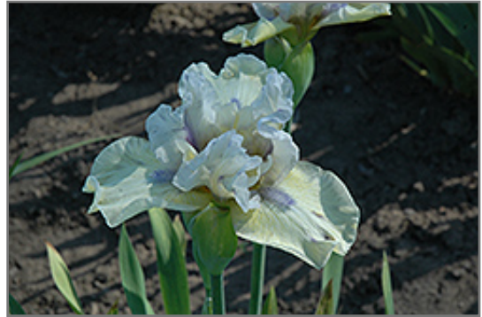
Calling Card Iris flowers