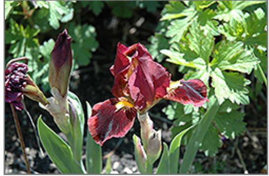
Little Annie Iris flowers