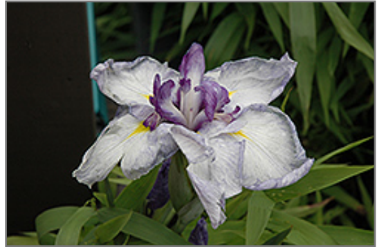
Cascade Spice Japanese Iris flowers

Other Names: Japanese Water Iris, Russian Iris, Japanese Flag