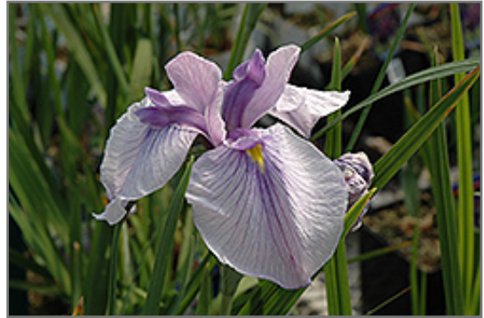
Imperial Magic Japanese Iris flowers

Other Names: Japanese Water Iris, Russian Iris, Japanese Flag