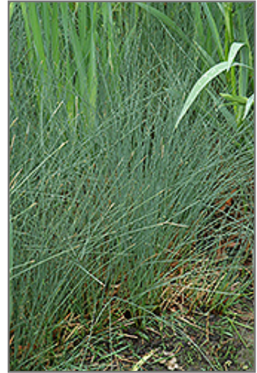
Soft Rush

Soft Rush will grow to be about 3 feet tall at maturity, with a spread of 12 inches. Its foliage tends to remain dense right to the ground, not requiring facer plants in front. It grows at a fast rate, and under ideal conditions can be expected to live for approximately 8 years. As an herbaceous perennial, this plant will usually die back to the crown each winter, and will regrow from the base each spring. Be careful not to disturb the crown in late winter when it may not be readily seen!