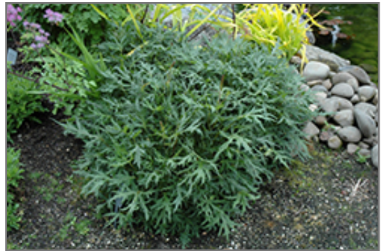
Dragon's Breath Rayflower