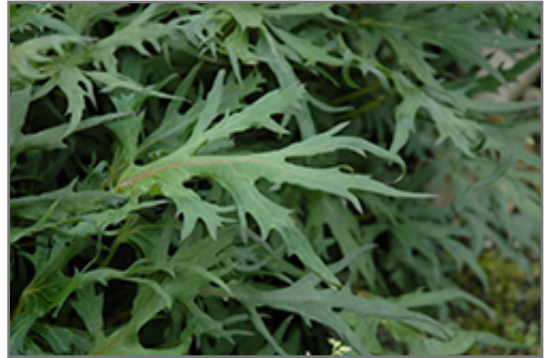
Dragon's Breath Rayflower foliage

Dragon's Breath Rayflower is recommended for the following landscape applications;